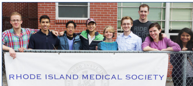
Above: State House press conference on health care, Brown MSS at the AMA, CPT update seminar, bike helmet distribution, medical student volunteers; Upper right: Meeting of RIMS membership committee