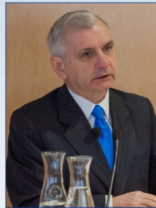
U.S. Senator Jack Reed