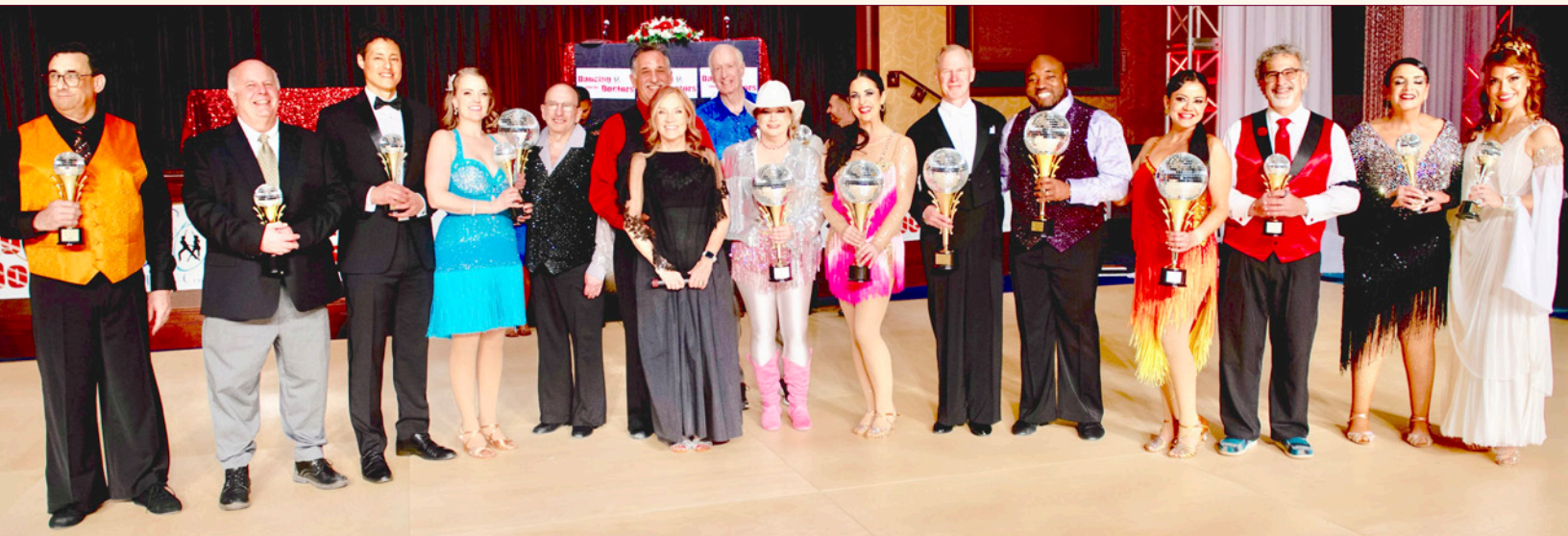
The winner’s circle at this year’s event.

Plans are already underway for next year’s event, planned for April 10, 2027. For more information, visit https://www.dwt-docs.com/about-dancing-for-a-cause ❖