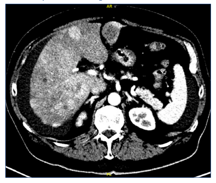
Figure 1. Initial CT from outside facility, liver window demonstrating numerous hepatic lesions with stigmata of necrosis.

an unintentional 40-pound weight loss over the course of one year. He reported four months of exertional dyspnea, fatigue, generalized abdominal discomfort, intermittent diarrhea, nausea, and vomiting. The patient did not drink alcohol, and his colonoscopy two years prior was remarkable for a single tubular adenoma that was removed. Family history revealed siblings with rectal, breast, and prostate cancer.