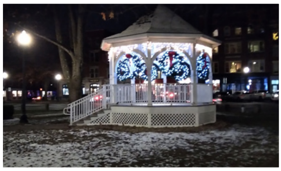
Festive holiday lights on the gazebo in Central Square.

Wherever you may be, or wherever your travels may take you, check the Journal on your mobile device, and send us a photo: mkorr@rimed.org .