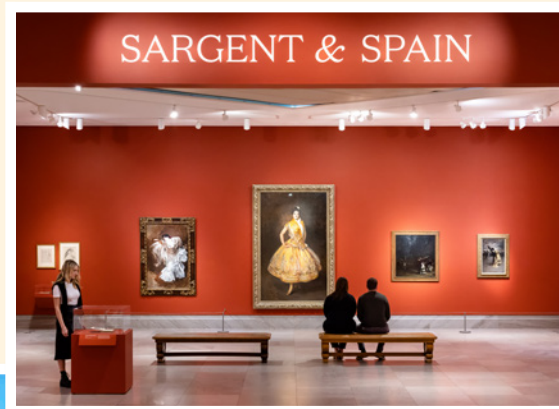
Installation view of Sargent & Spain , Legion of Honor, San Francisco, 2023.