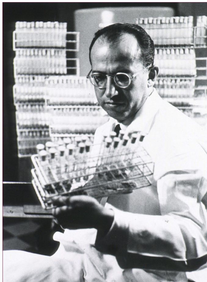
Dr. Jonas Salk, 1955

massive inoculation campaign was then undertaken in 1954 with 1.83 million children receiving the Salk vaccine. In the following year his results were published in the Journal of the American Medical Association , and on April 12, 1955, a number of monitoring committees jointly declared the injectable vaccine to be both safe and effective.