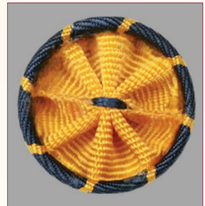
The 2019 Fellows will receive rosette pins in gold and blue, colors symbolizing science and engineering, at the 2020 AAAS Annual Meeting.

In order to be considered for the rank of Fellow, a AAAS member must be nominated by three previously elected Fellows, the steering group of a AAAS section, or the organization’s CEO. Nominations go through a two-step review process, with the relevant steering group reviewing nominations in their section and the AAAS Council voting on the final list. ❖