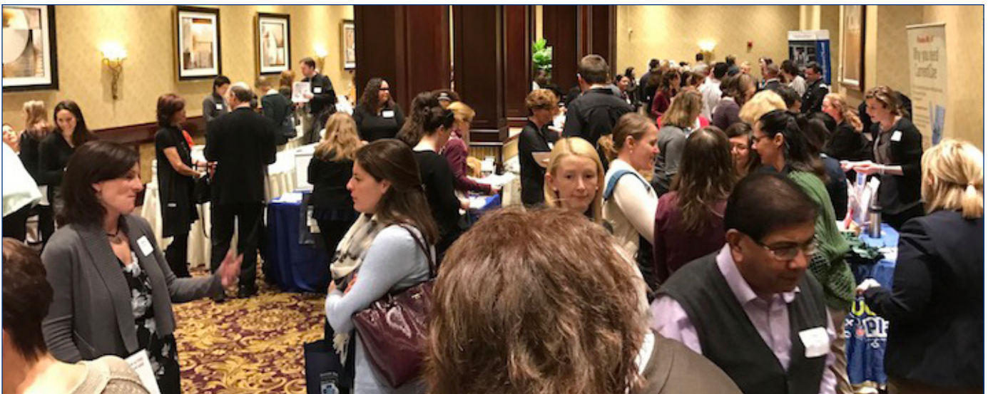
More than 20 exhibitors displayed their programs and organizations at the event.