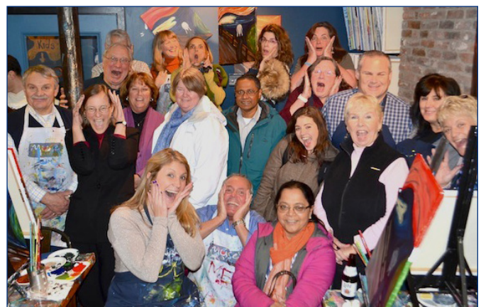
RIMS hosts social events throughout the year for members and guests.

Click here to learn more about membership.