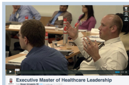
VIDEO Overview of Brown's Executive Master of Healthcare Leadership.

The EMHL curriculum includes data-driven decision making, finance, health IT and electronic records, management and marketing, policy and regulatory issues, strategic planning, quality improvement, and other core topics;